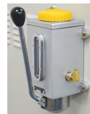
Optional EvenFlow™ reservoir and pump